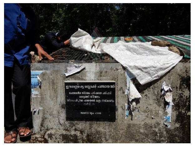
Renovated pond at Aniyilapp