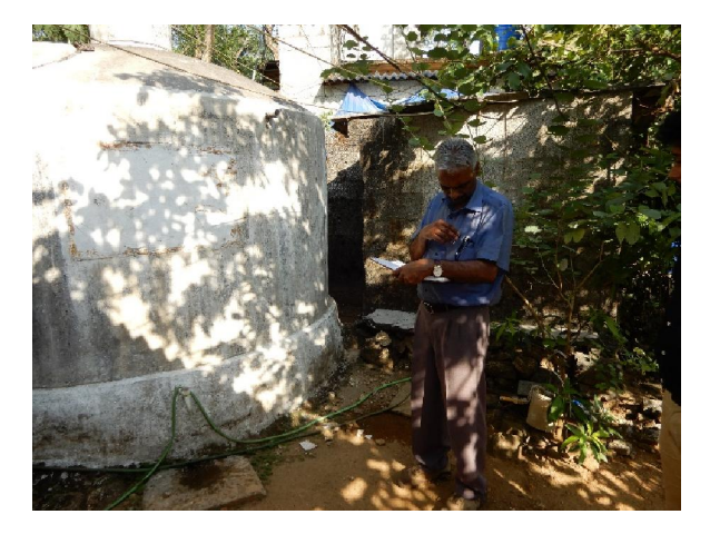
Rainwater harvesting tank in Nedungazhi watershed