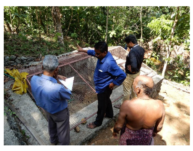
Spring protection and renovation in Nedungazhi watershed