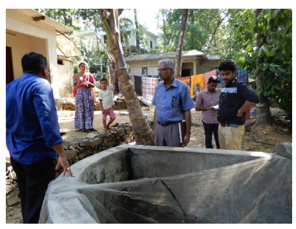
Newly constructed well at Aaniyilappu