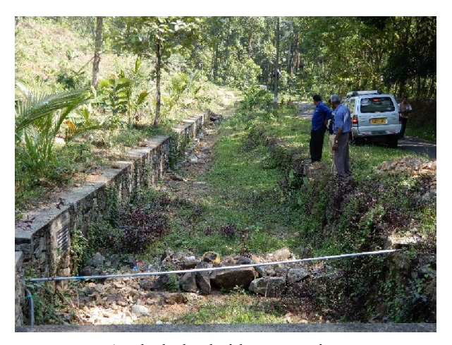
Arukulathod side protection