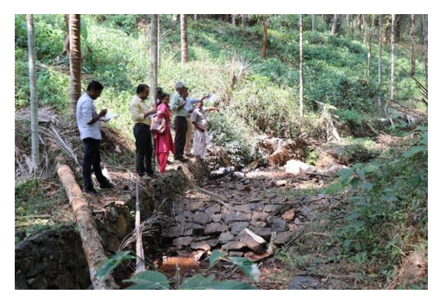
Side protection and gully plugging of Kallarstream in Aadakom watershed