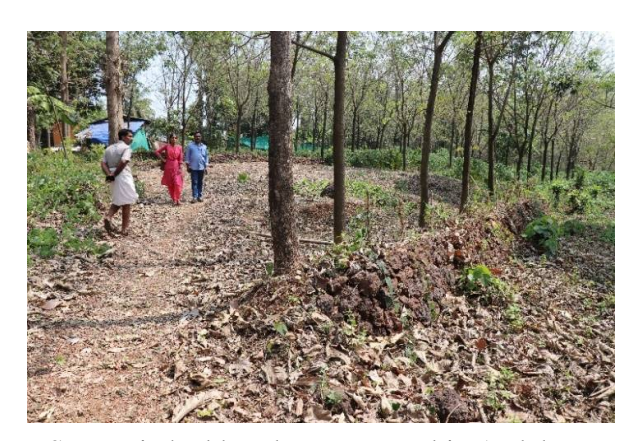
Stone pitched bunds constructed in Aadakom watershed