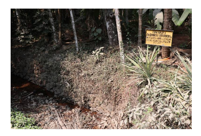
Side protection work of a stream in Kuyyangad watershed