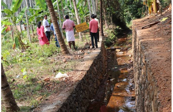
Protection work of Pallam in Iriya watershed Side protection work of a stream in Chenthalam watershed