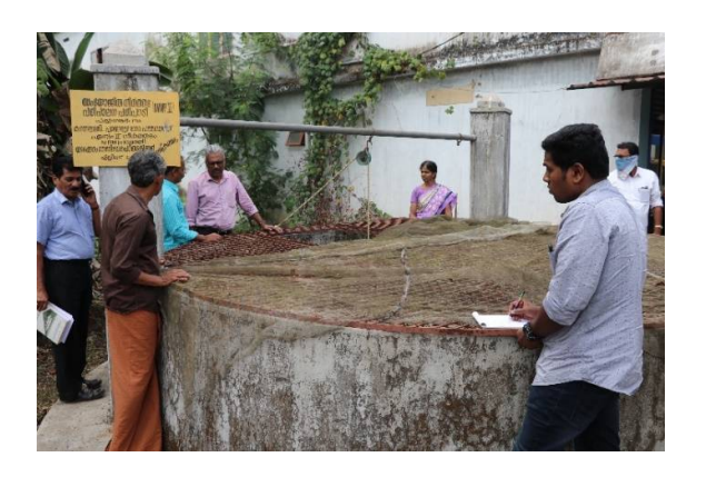
A well constructed in the project area