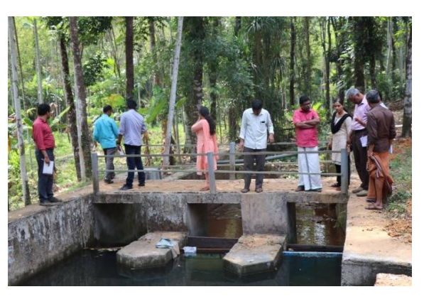
A VCB across the stream in Eriam watershed