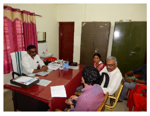
Interaction with BDO, Ithikkara and staff