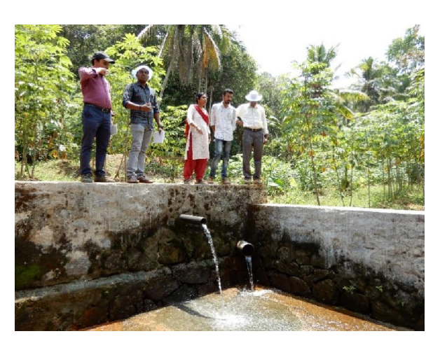
Perennial spring protection at Anjaam Poyka