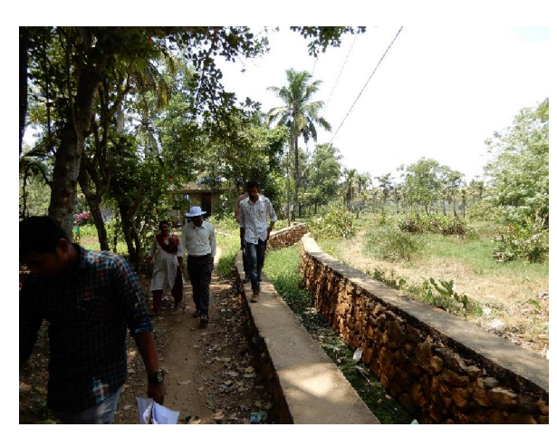
Side protection work of Moozhiyil Thodu in Mylakkadu watershed