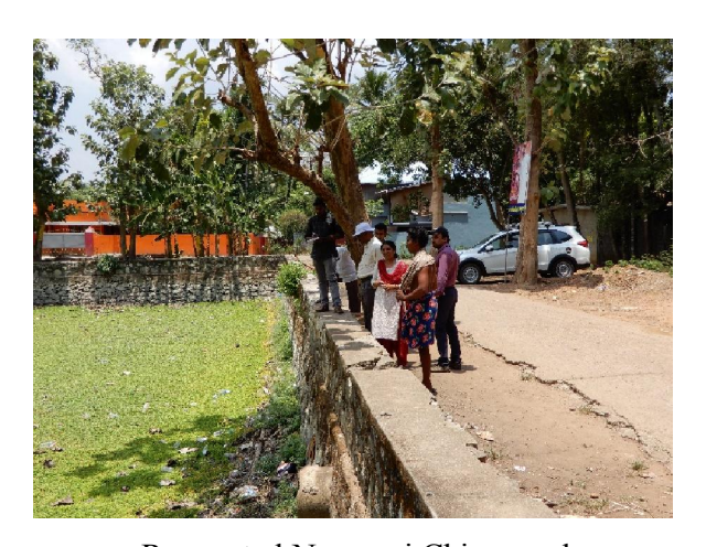
Renovated Nenmani Chira pond