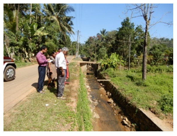
Side protection work in Ammara watershed