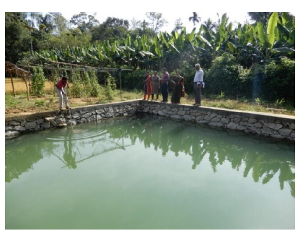
Newly constructed pond in Pozhuthana 5 watershed