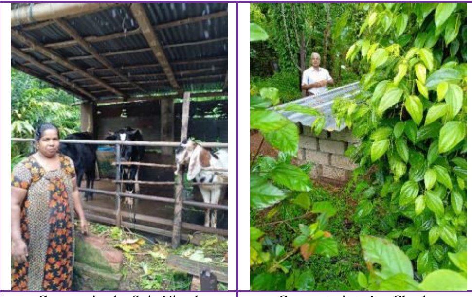
Cow rearing by Suja Vinod