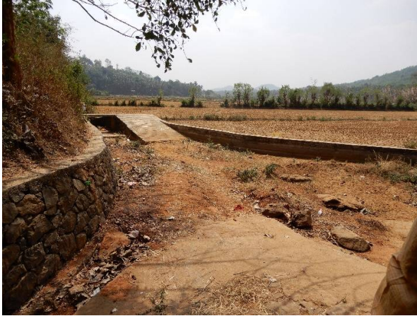
Tractor passage constructed at Ayyappamukku in Mangattupadam watershed