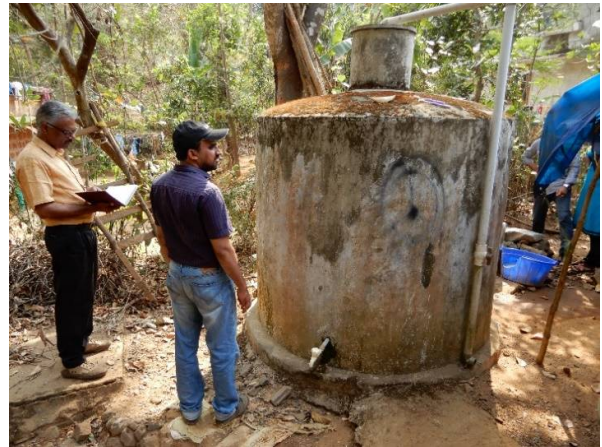
Water harvesting tank installed in the plot of one of the residents in Vellapokkapaadam watershed