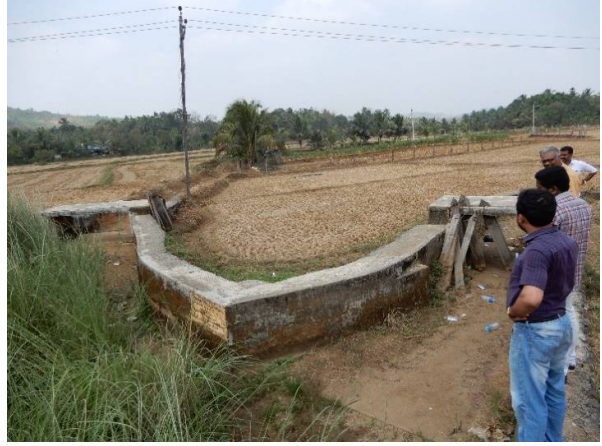
Kurumakkavu VCB constructed in Kanjirakkodu watershed