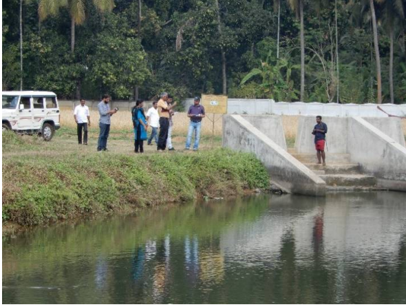
Renovated Kunjikkulam pond in PuthuthuruthiThodu watershed