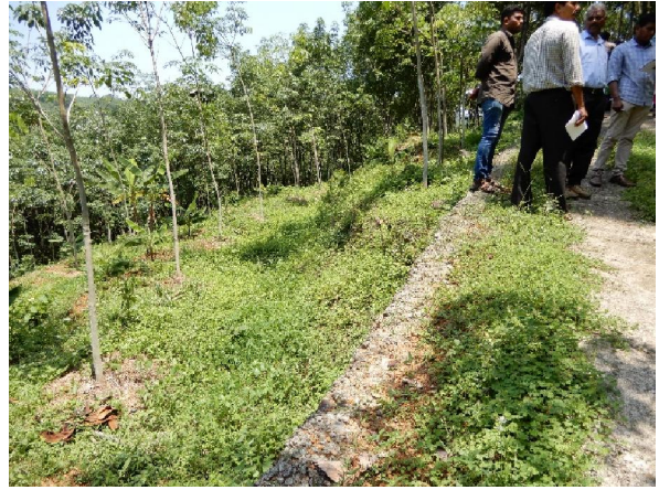
Contour bund constructed in Mulamkunnilpadi watershed