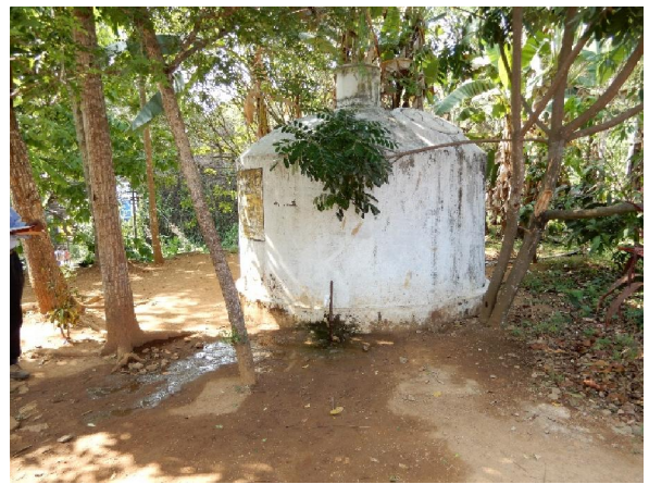
Rainwater harvesting tank constructed in Govt. U P School Chittar