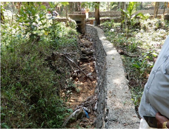
Side protection work of Dharalayam Thodu