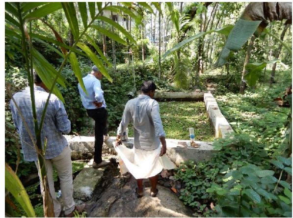
Renovated pond in Panniyar Colony