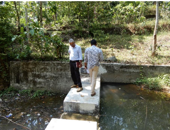
Check dam constructed across Kannanumon Thodu