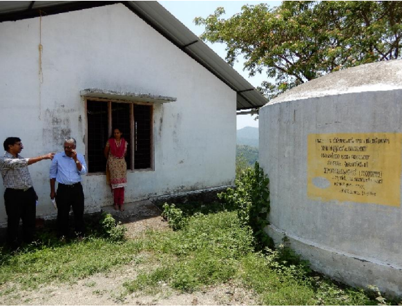
Rainwater harvesting tank at Remabhai Colony Community Hall