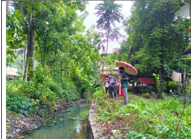
Side Protection wall at Manneettithodu