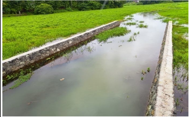
Deepening and Maintenance of Nedumprayar-Punchavachalthodu