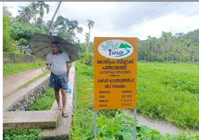
Side Protection wall Treasury padi-Kurunthottipadi