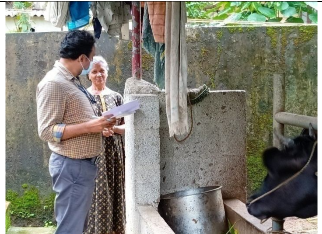
Production system by Usha Raju