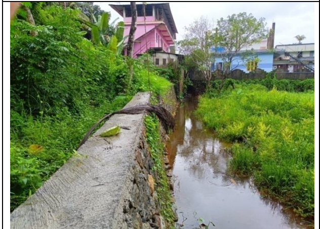
Side protection wall in Vennikulam Kochuthodu