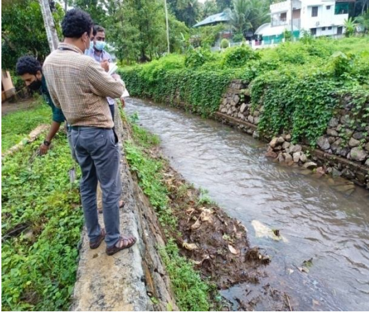
Side protection wall Erappanthodu