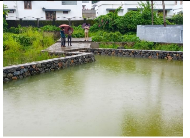
Vallathok Pond renovation