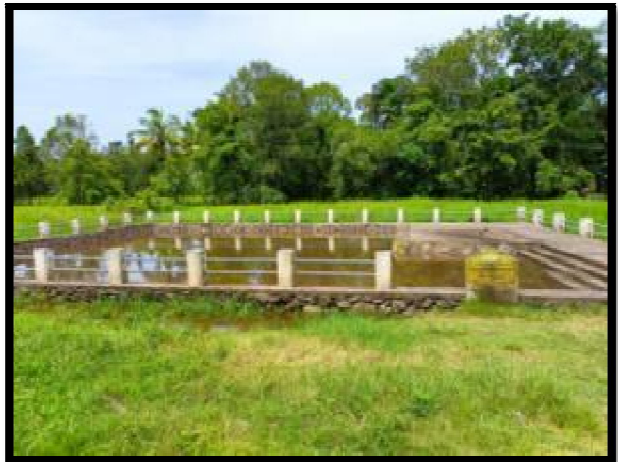
Pond at SNDP Temple at Chathankery watershed