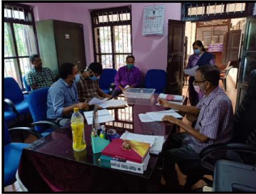
Fig 2: CWRDM team at BDO office, Pulikeezh

The evaluation team from CWRDM visited the project area on 08/07/2022. At the outset held discussions with the BDO, Technical Expert, and the VEOs who have associated with the implementation of the scheme, at Pulikeezh Block Office. It was reported that the project was well conceived and totally beneficial for the stakeholders in conserving the natural resources and for the overall socio-economic improvement of the area.