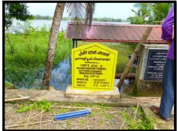
Box Culvert at Chennankeri in Ayyankonari watershed