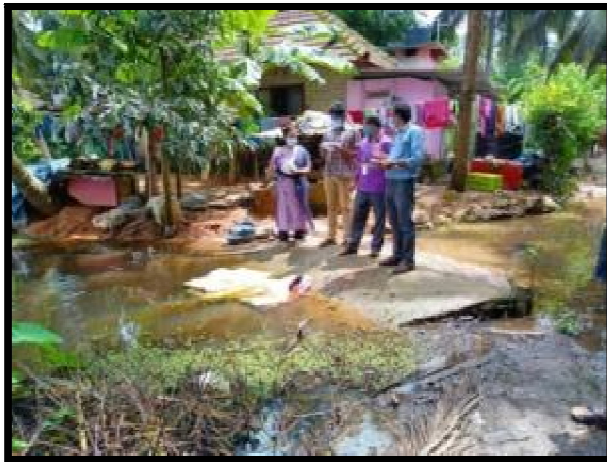
Construction of Ramp at Chathankery watershed