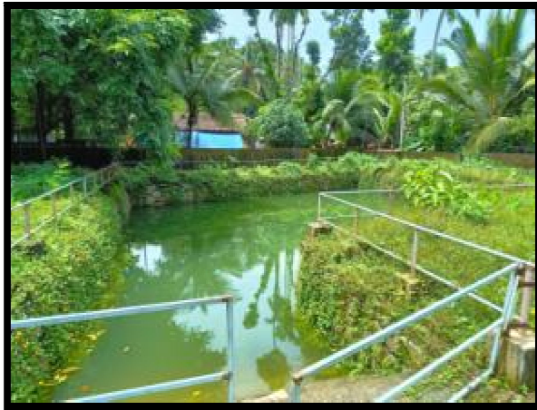
Pond renovation at GHSS school Peringara in PodiyadiPuthenthodu watershed