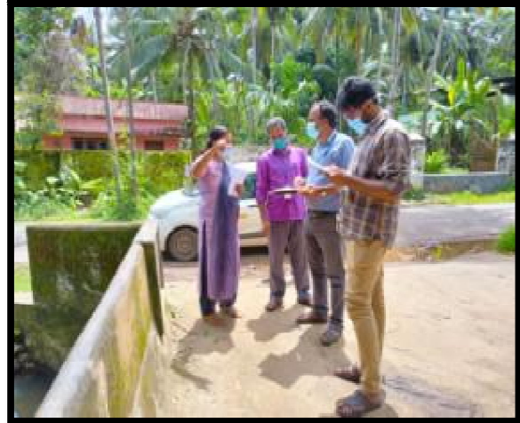
Construction of Box Culvert at Manappurathuppady