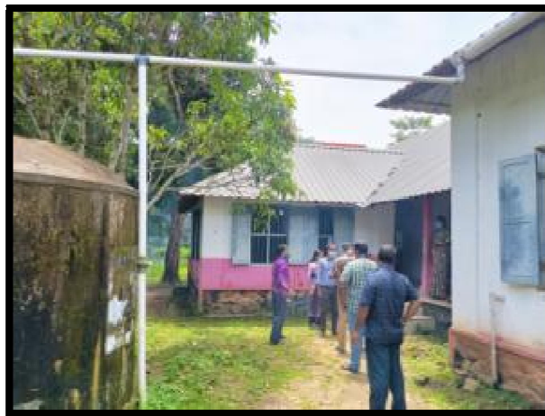
RWH at GUPS Kadapra at Ayyankonari watershed