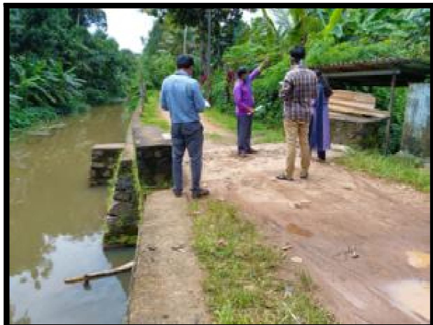
Side wall protection with Culvert renovation at