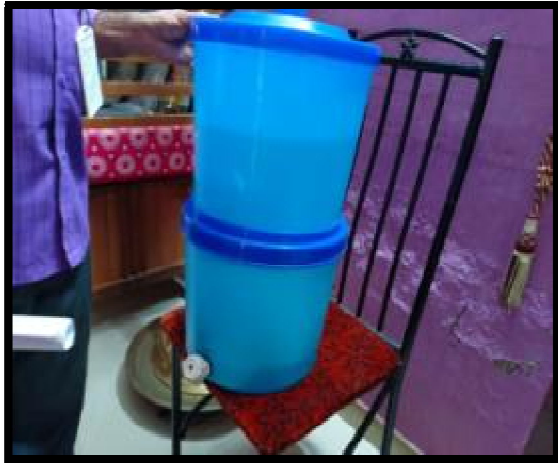
Terra fill Water filter