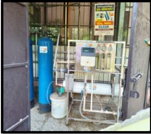
RO Plant at Pulikeezhu Block Panchayath