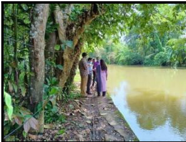
Deepening, Desiltation, Sidewall stabilisation of