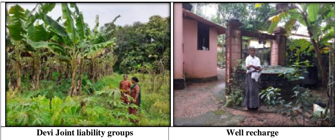
Devi Joint liability groups

Due to this project, water could be able to flow smoothly and thereby preventing waterlogged conditions in the neighbourhood. This initiative has helped to some extent to resolve the flooding problem. The irrigation facilities for farming in the surrounding areas were also made possible by this project. After this effort, streams were found to have a two-month improvement in water flow. A 2% increase in cropping intensity was observed.